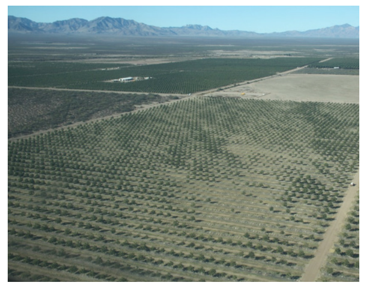
Figure 10. Aerial view of young pecan orchards with severe tree loss and damage due to root rot.

white cottony mycelial growth. Below this mycelium, the bark is destroyed, and the fungus fills the vascular tissue of the tree. Following death of the tree, sclerotia form in the strands to complete their life cycle.