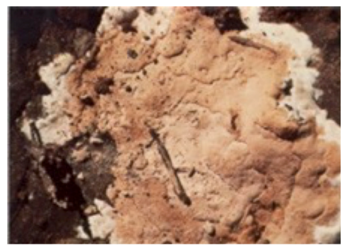
Figure 8. Spore mat on the moist soil surface during the summer monsoon season