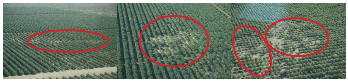
Figure 9. Aerial view of disease foci pecan orchards infested with root rot.