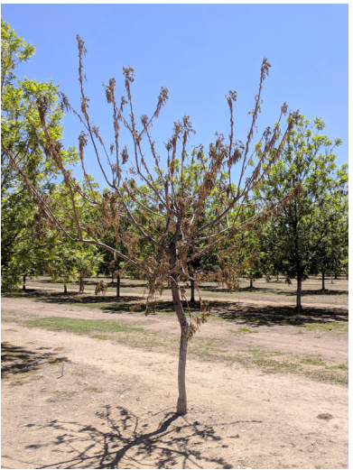
Figure 4. Infected pecan trees killed by PO. Dry, yellow leaves remain attached to the plant.