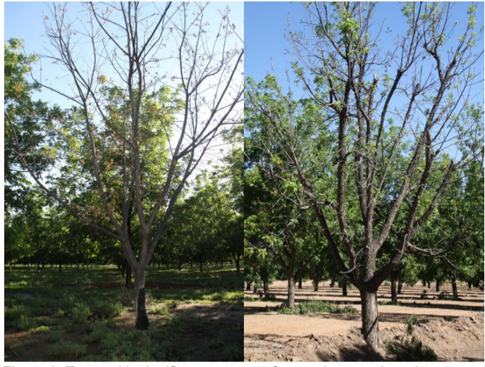
Figure 3. Trees with significant amount of roots destroyed produce new growth in the spring. Leaves wilt and die after bud break and blooming.

often wilt and die suddenly. Leaves will turn yellow or brown quickly and remain firmly attached to the tree, as if they are going dormant in the middle of summer (Figure 4). The reason for this sudden death is the inability of rotted roots to take up and translocate sufficient water to support the canopy. The term "flash" has been coined by some in pecan industry to describe this seeming overnight tree death. Other trees with PO infection, such as those in a residential setting, have been described by their owners: "It just died overnight". The affected trees may also become girdled at the soil line. Some PO-infected pecan trees at elevations above 4,500 feet can survive the hot summer conditions, but branch dieback with severe defoliation and significant yield reduction are often observed (Figure 5).