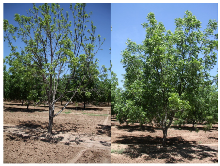
Figure 2. The pecan tree in the left panel is infected by PO and the one in the right panel is a healthy tree. The affected trees leafed out at least two weeks later than healthy trees.