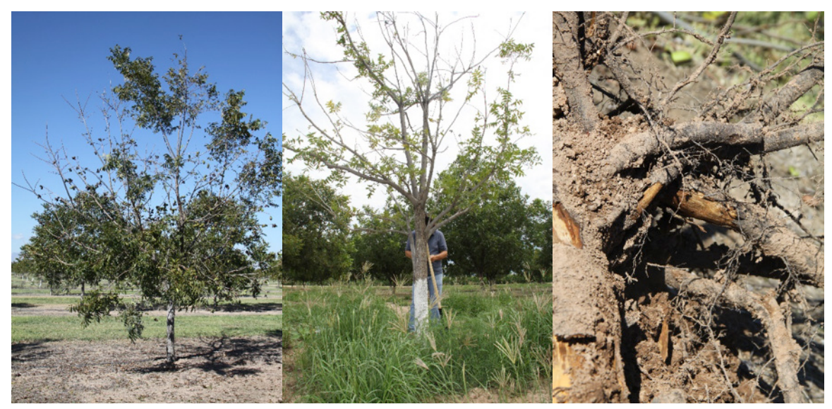
Figure 5. Defoliation, branch dieback, and root rot on a PO-affected pecan trees that survived the hot summer.

Additional symptoms observed in the roots of infected plants include: root bark that is decayed and brownish, and bronze colored wooly strands of the fungus are frequently visible on the root surface (Figure 6). These wooly strands, when viewed under a compound microscope will show the unique identifier