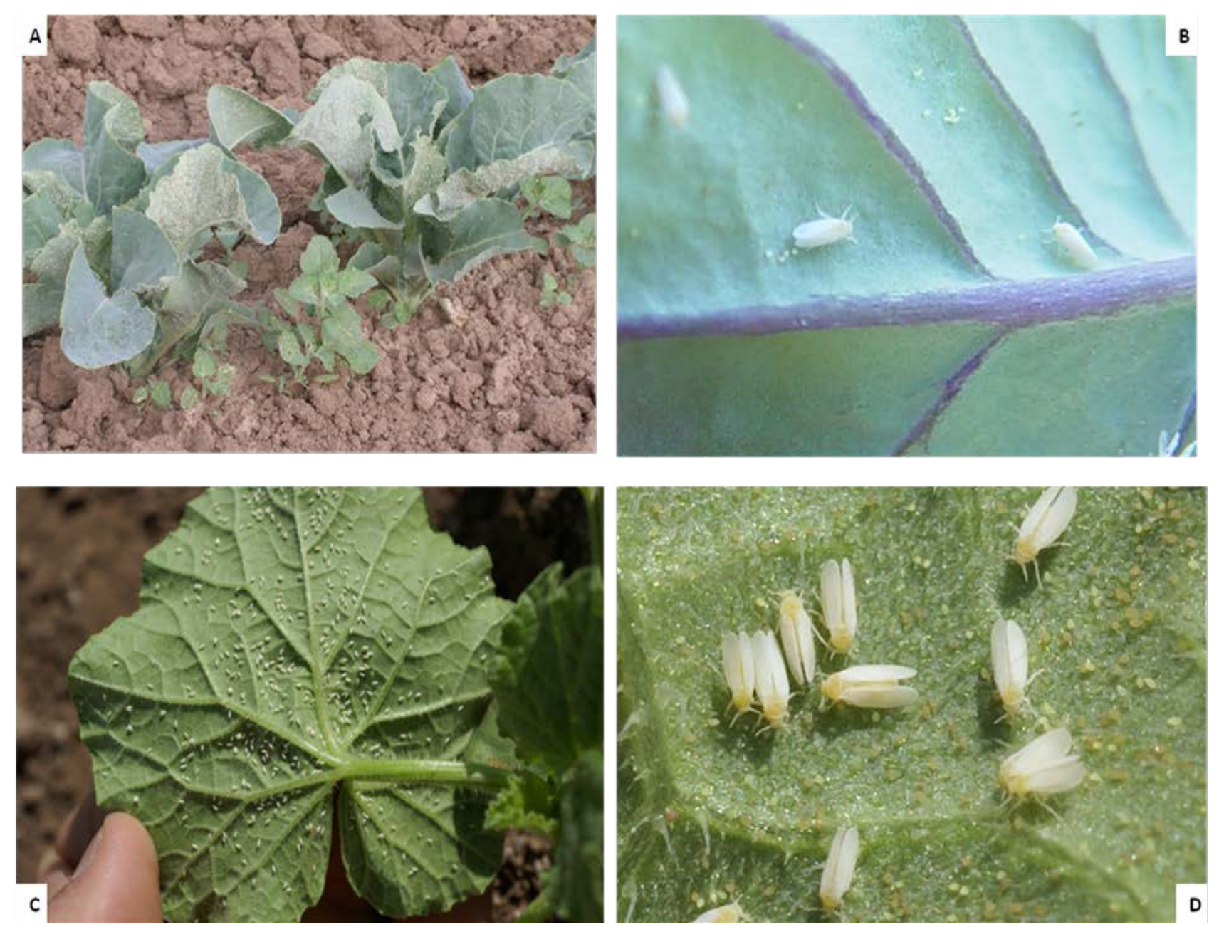
Plate 1. A) Adult sweetpotato whiteflies (SWF) infesting cauliflower plant, B) SWF adult and eggs on Cauliflower leaf, C) SWF adults infesting cantaloupe leaf, D) SWF adult and eggs on cantaloupe leaf

VegIPM Update, Vol. 4, No. 12 –Jun 26, 2013