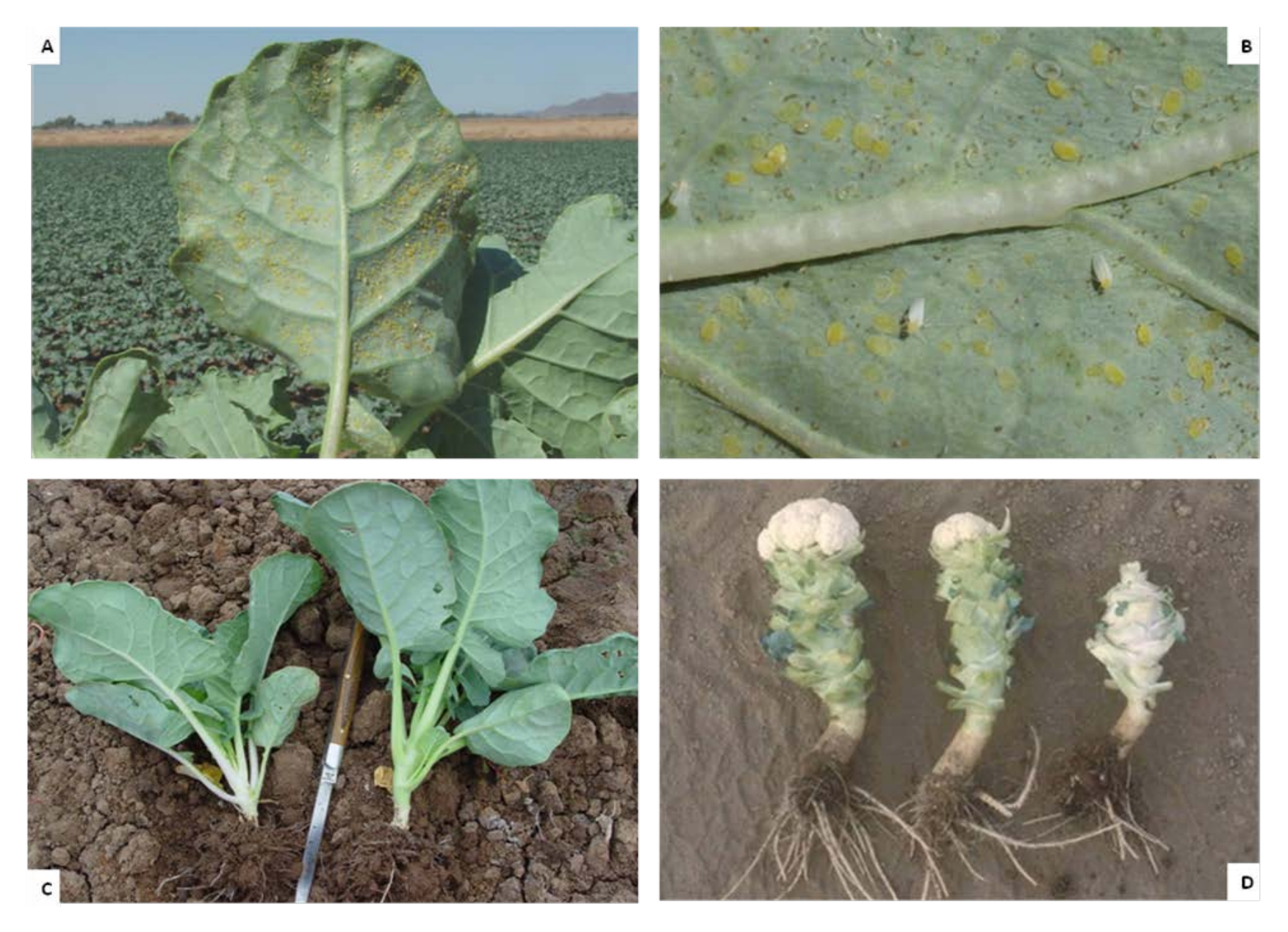
Plate 2. A) SWF nymphs infesting broccoli plant, B) SWF nymphs on cauliflower leaf, C) SWF feeding damage to young broccoli plant (on left); note early signs of "stalk blanching and reduced plant size, D) SWF feeding damage to mature cauliflower plant (on right); note severe "stalk blanching" and delayed curd maturity