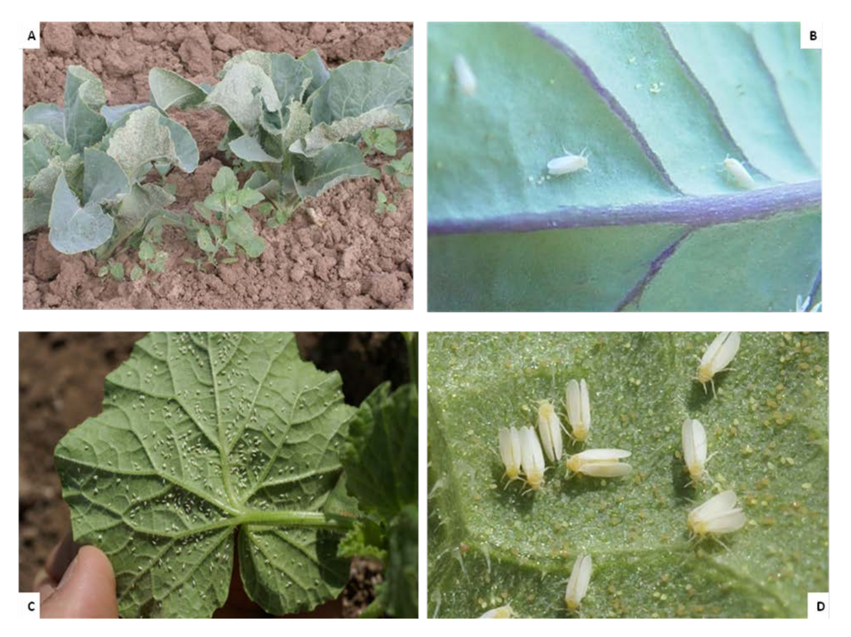
Plate 1. A) Adult sweetpotato whiteflies (SWF) infesting cauliflower plant, B) SWF adult and eggs on Cauliflower leaf, C) SWF adults infesting cantaloupe leaf, D) SWF adult and eggs on cantaloupe leaf