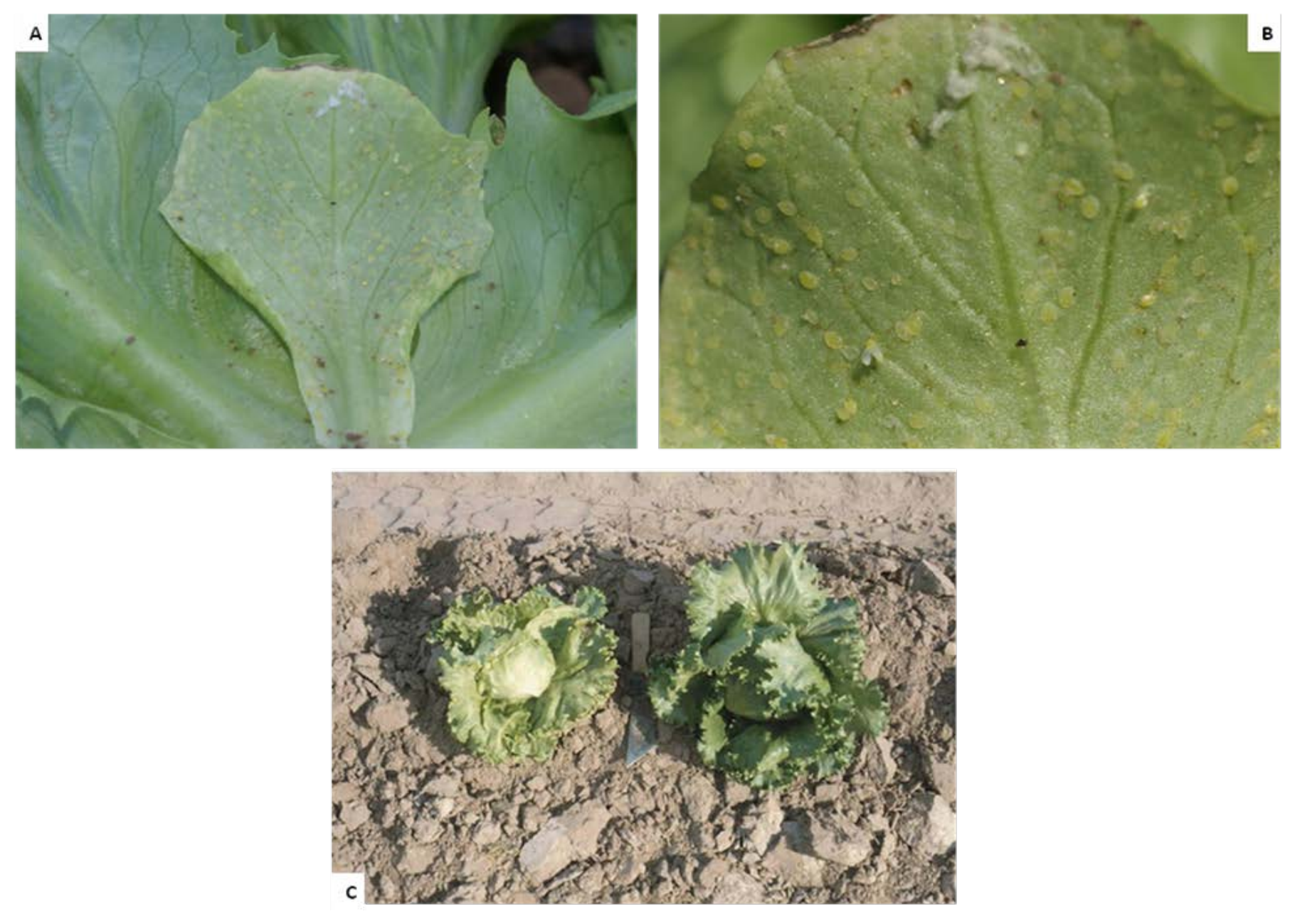
Plate 4. A) SWF nymphs infesting lettuce leaf, B) SWF nymphs on lettuce leaf, (C SWF immature feeding damage to head lettuce (on left); note the reduced size and yellow coloration of leaves and head.