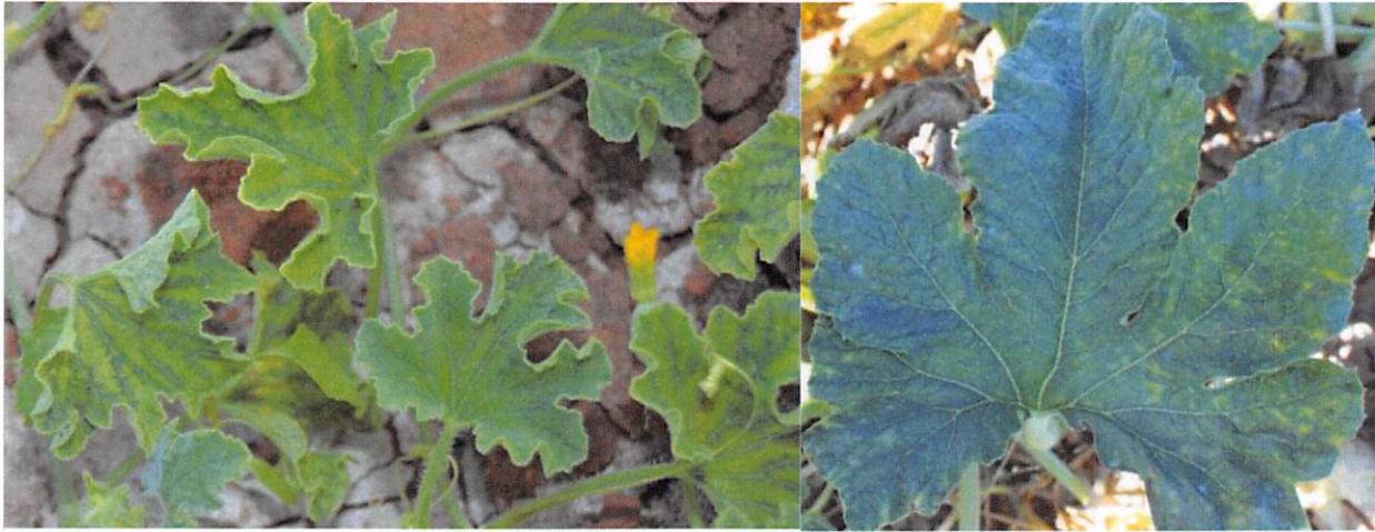
Figure 1. On the left, symptoms of slight yellowing of the foliage followed by vein clearing in a field grown melon and on the right yellow mottling and vein clearing symptoms in a field grown pumpkin, symptoms are presumed to be due to the newly identified ipomovirus infection; both tested positive for infection with the new virus.

While it is too early to know what the impact, if any, of this new ipomovirus will be on cucurbit production in the Desert Southwest U.S., it is important to be aware of the potential of this virus to infect and injure cucurbit crops in California and Arizona. Please report any suspicious virus-like symptoms in watermelons, melons, pumpkins or squashes to your local Cooperative Extension or Agricultural Commissioner office.