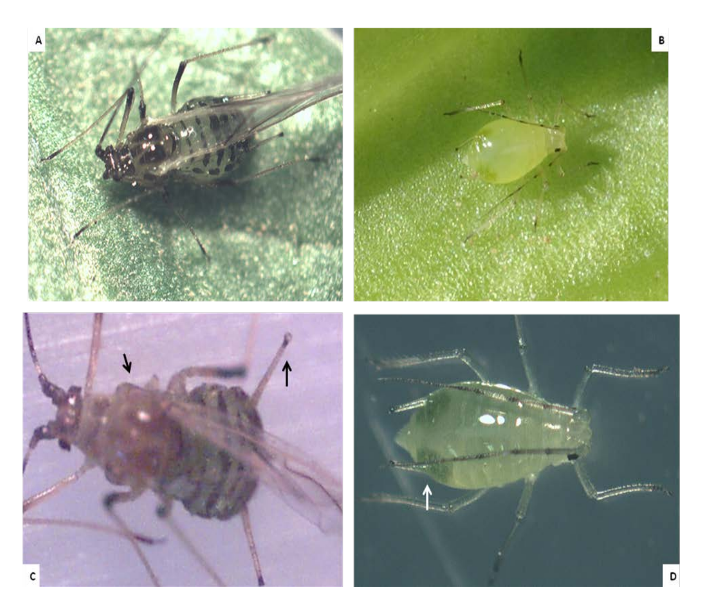
A) Foxglove Aphid (FGA) mature alate, B) Mature FGA apterous nymph, C) FGA Alate; note the light thorax and dark tips on cornicles, D) FGA apterous form; note dark patches at base of cornicles.

The best way to manage aphids in desert growing areas is to follow a preventative foliar approach. Fields not planted with imidacloprid are routinely treated with foliar insecticides upon detection of aphid colonization. Foliar sprays should be applied for aphid control based on a simple action threshold; when an average of 10% of plants has aphid colonies (2 or more immature apterous aphids) present. Plants should be sampled 5-7 days following sprays and retreated if the threshold is exceeded again. Below is a chart that summarizes relative efficacy of most products labeled for foxglove aphids in lettuce: