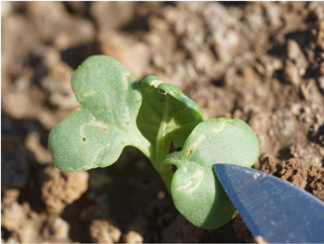
Figure 5. Mines and exit holes resulting from feeding by 1 st instar DBM larvae in broccoli cotyledons.