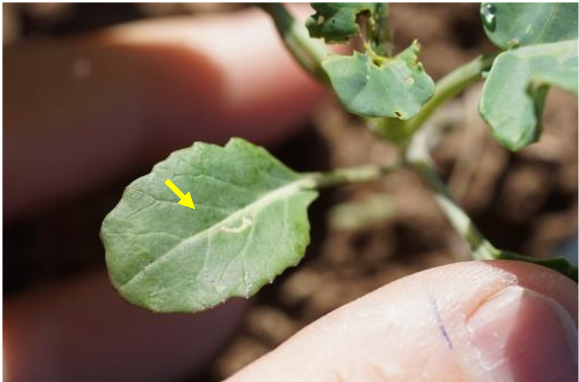
Figure 4. 1 st instar DBM larva mining in the leaf tissue in broccoli transplant.