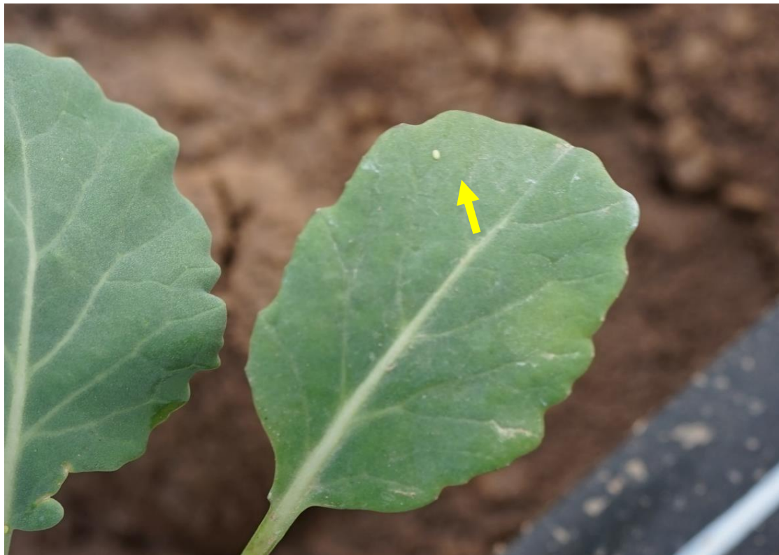
Figure 2. DBM egg on seedling cauliflower plant