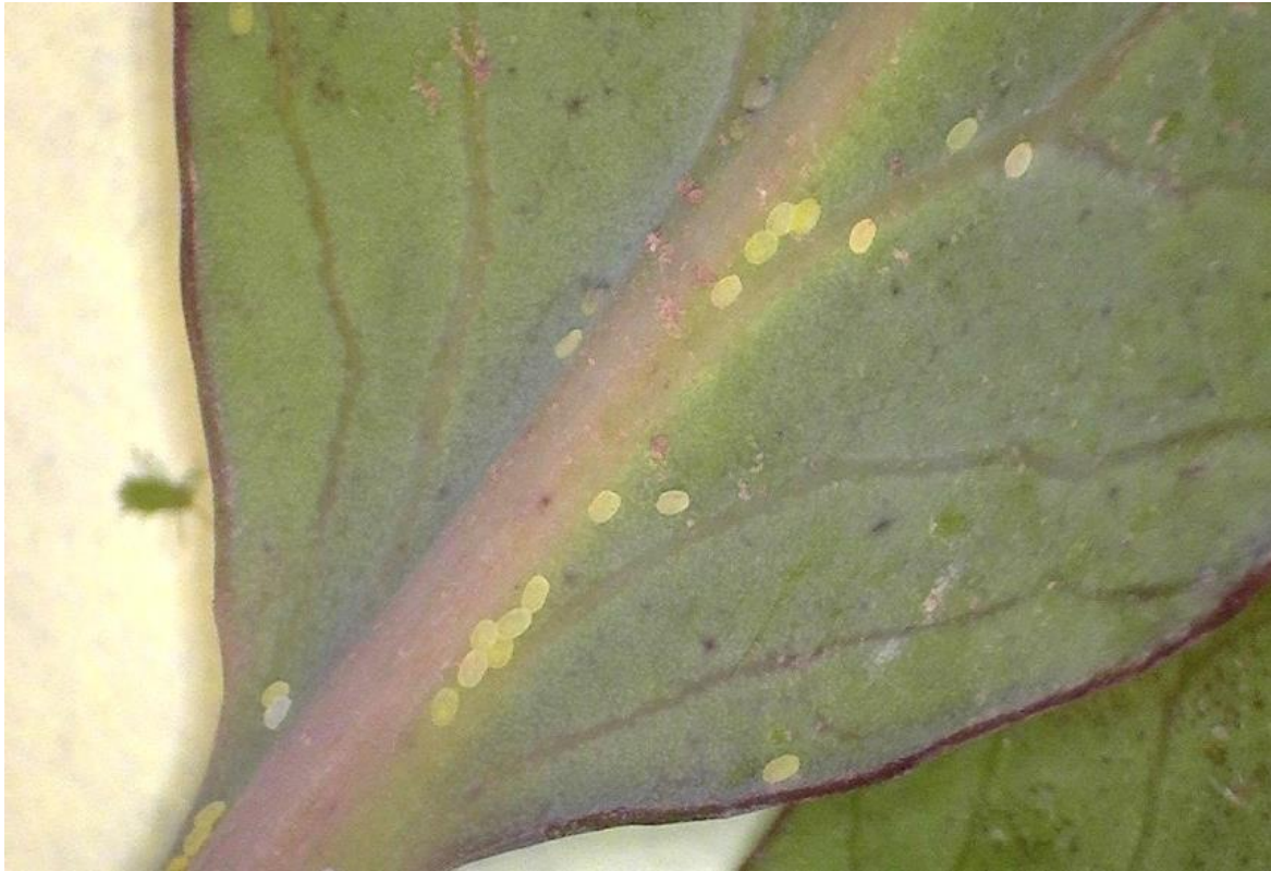
Figure 3. DBM eggs on cabbage transplant