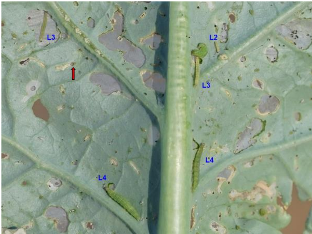
Figure 6. 2 nd – 4 th instar larvae and damage on lower side of cauliflower leaf.