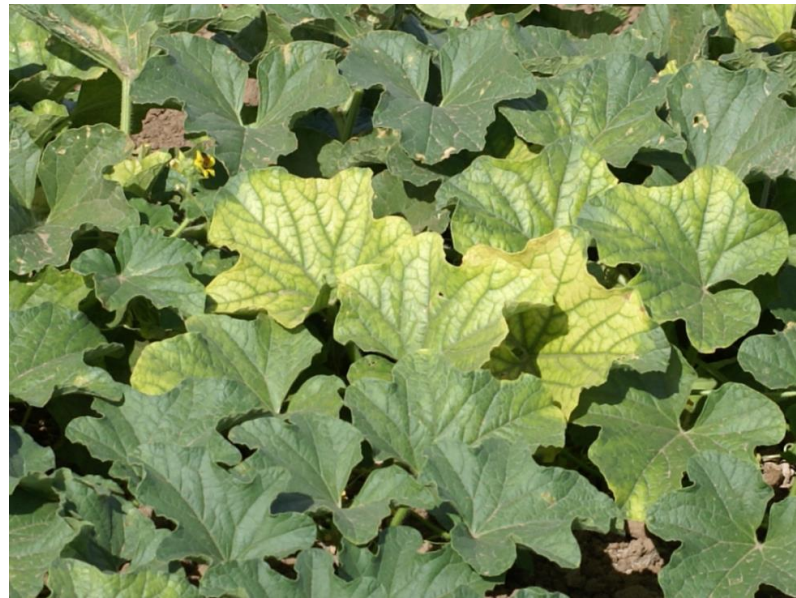
Plate 2. SWF nymphs infesting cantaloupe leaf (upper left, bottom left). SWF immature feeding damage to cantaloupes; note the heavy contamination of sooty mold on mature fruit (upper right). SWF adult feeding damage to cantaloupes; note the interveinal chlorosis symptoms of CYSDV on crown leaves (lower right).