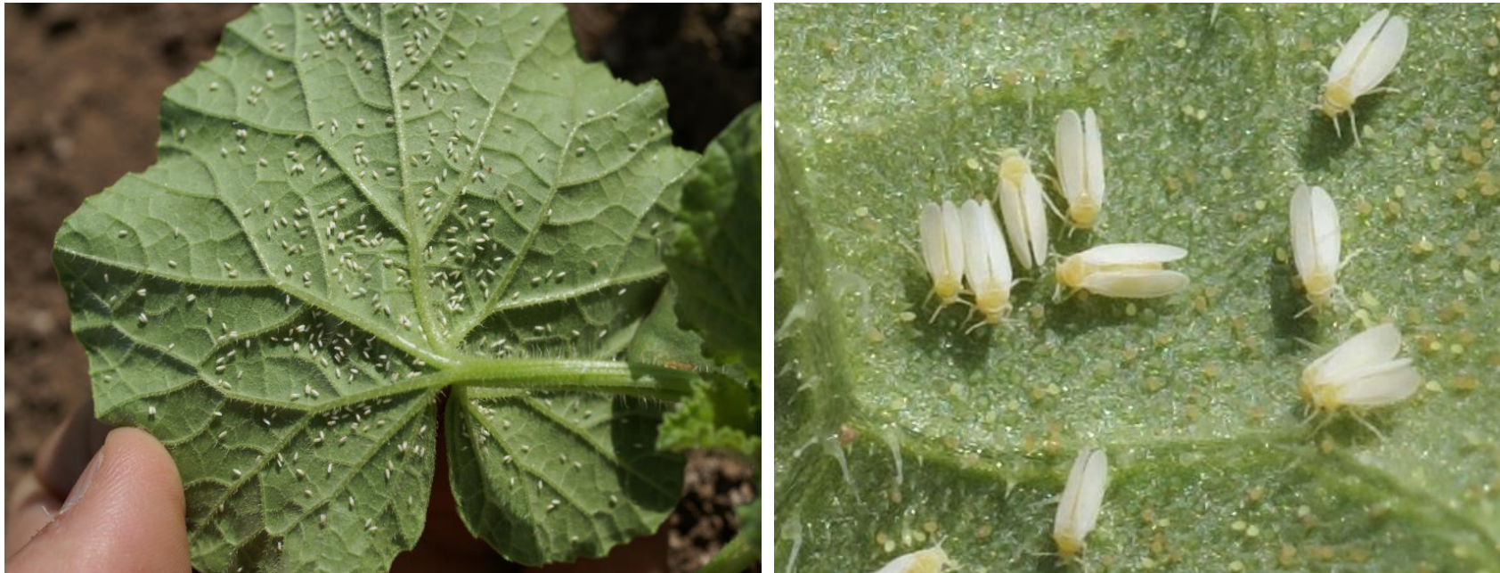
Plate 1. A) Adult sweet potato whiteflies (SWF) infesting cantaloupe leaf. Note SWF adult and eggs on cantaloupe leaf (right image)