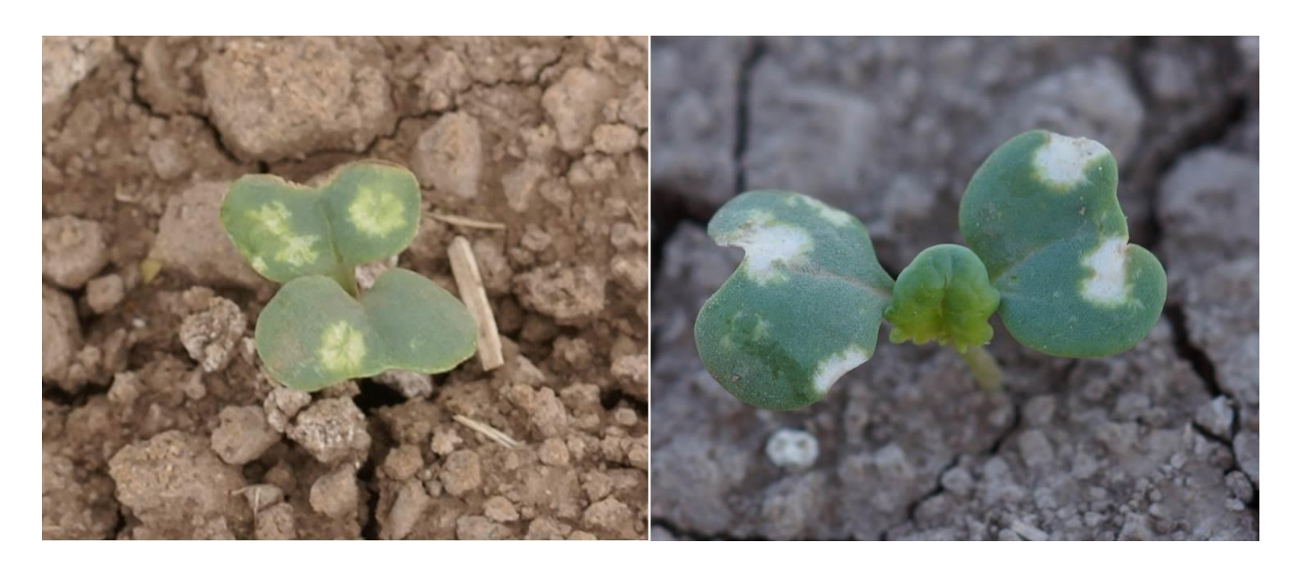
Fresh (left) and old (right) Bagrada bug feeding signs on broccoli cotyledons.