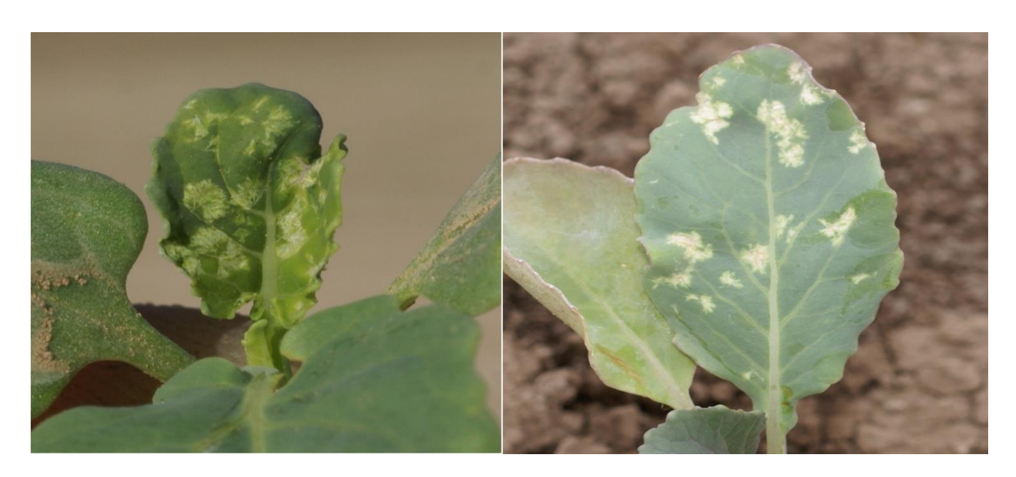
Fresh feeding signs on 2-leaf broccoli (left), old feeding signs on cauliflower leaf 7-d following transplanting (right).