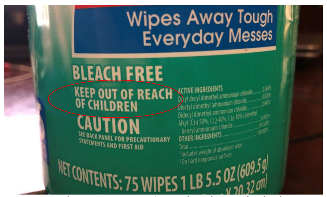
Figure 1. Disinfectant product with "KEEP OUT OF REACH OF CHILDREN".

1. Disinfectant wipes are EPA registered antimicrobial pesticides designed to kill or inactivate microbes (germs). Many have "KEEP OUT OF REACH OF CHILDREN" (Figure 1) clearly stated on containers. The CDC states "Disinfection products should not be used by children or near children. Ventilate the space when using these products to prevent children from inhaling toxic vapor".