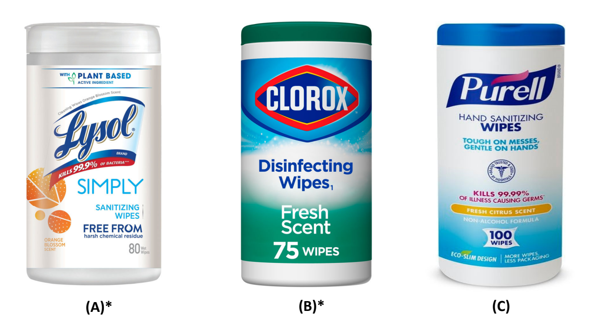
Figure 2. Many types of wipes are available for purchase.

warning. (B) EPA registered disinfectant wipes for non-food-contact surfaces. The wipes should be used so the surface remains wet for a 4-minute contact time*. Following the contact time, the surface should be rinsed thoroughly with potable water if contact with food is likely. Hands must be washed well with soap and water, even if chemically resistant gloves are used. The product has a "KEEP OUT OF REACH OF CHILDREN" warning. Contact times vary between surface disinfectants* and are stated on the label. (C) FDA regulates hand sanitizers since these are over-the-counter products for your hands and are <u>not</u> designed for cleaning surfaces. The product has a "Flammable" and "KEEP OUT OF REACH OF CHILDREN" warning. Please note, not all hand sanitizers are legitimate products. To check if your hand sanitizer is listed on the FDA DO NOT USE list go to: <a href="https://www.fda.gov/drugs/drug-safety-and-availability/fda-updates-hand-sanitizers-consumers-should-not-use#products">https://www.fda.gov/drugs/drug-safety-and-availability/fda-updates-hand-sanitizers-consumers-should-not-use#products</a>.