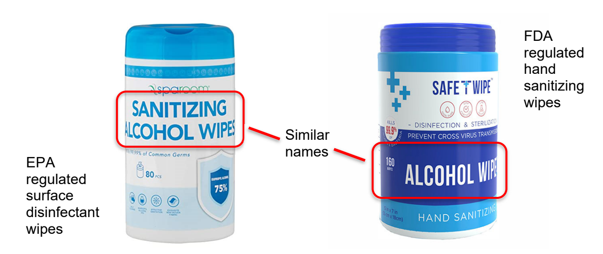
Figure 3. Both products are labeled as Alcohol Wipes , but the product on the left is an EPA regulated disinfectant for surfaces, and the product on the right is an FDA regulated hand wipe product.

Products for " surface " sanitizing (EPA antimicrobial pesticide) and " hand " sanitizing (FDA over-the-counter drug) may look very similar (Figure 3). Some have <u>different ingredients</u>, while some have similar ingredients. However, these products are regulated by two different agencies, and are NOT interchangeable.