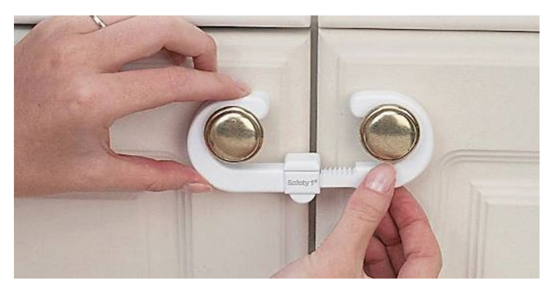
Store pesticides in locked cabinets.

In our August newsletter, we included a picture of a plastic "locking device" that could be used to secure cabinets. This was merely meant to illustrate that chemicals must be kept in a locked cabinet.