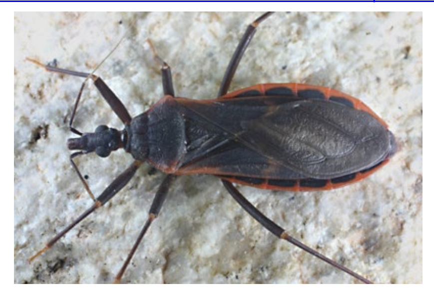
Figure 10: Adult kissing bug, Triatoma rubida (Photo: Jillian Savary).