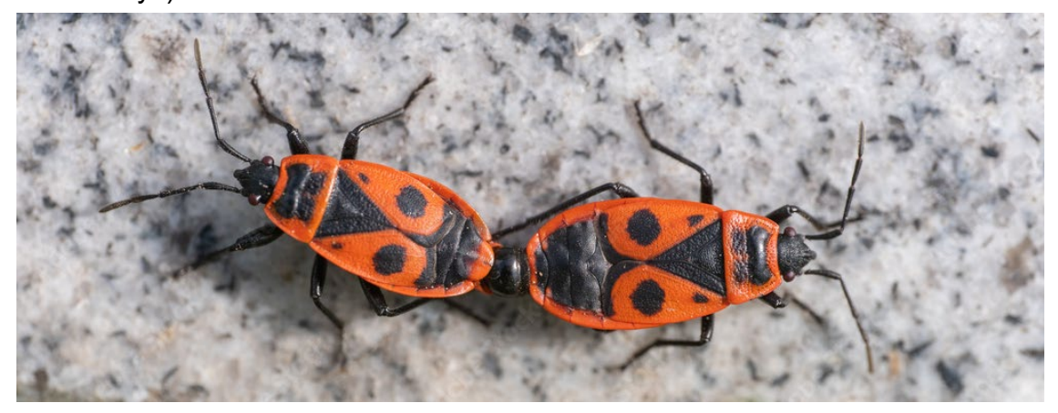
Figure 8: Red firebugs mating.

Red firebugs Pyrrhocoris apterus (Figure 8) are another species that display interesting mating behavior. During mating, they can be seen attached for long periods of time (12 hours to 7 days).