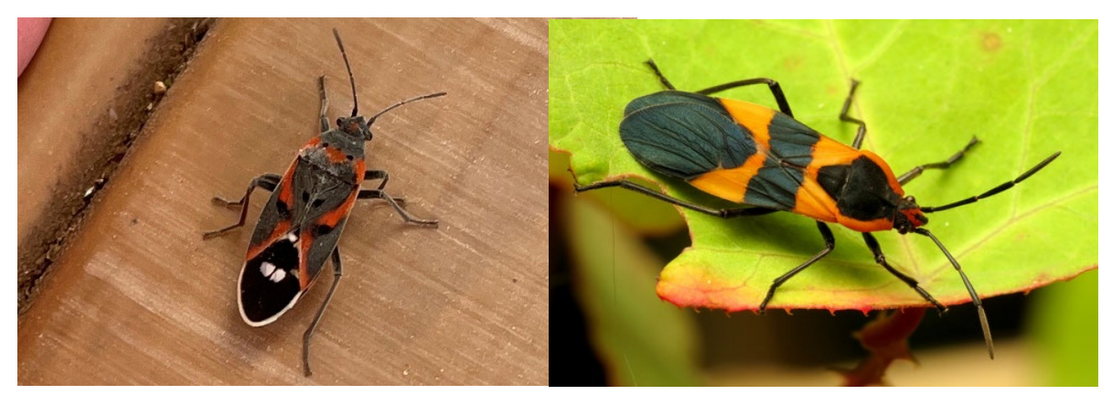
Figure 4: Left: Adult western small milkweed bug; Right: Adult large milkweed bug.

The large milkweed bug , Oncopeltus fasciatus is another common species. The adults have a prominent red and black "X" shaped pattern on their back (Figure 4).