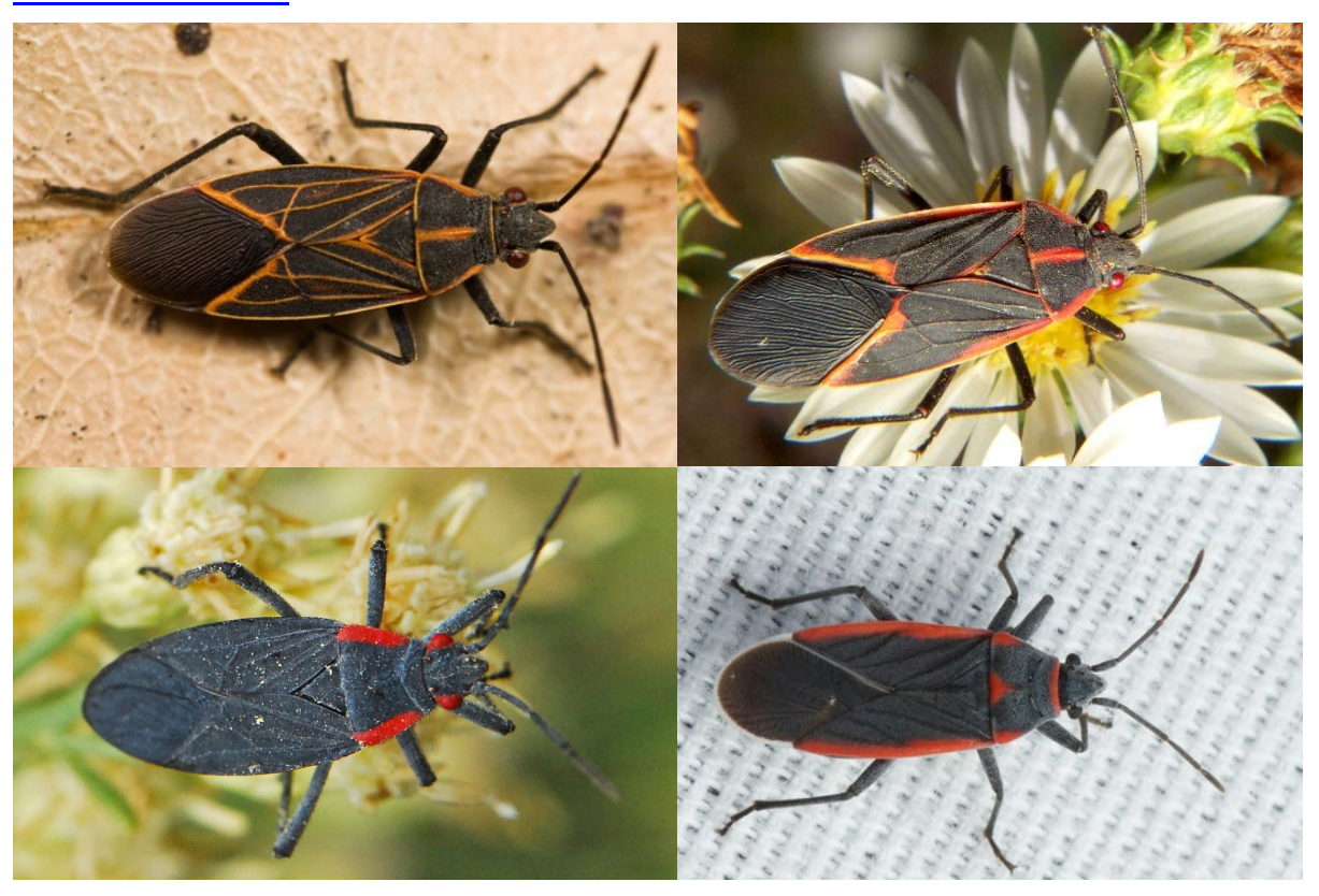
Figure 3: Top left: Adult western boxelder bug; top right: eastern boxelder bug; bottom left: red-shouldered bug; bottom right: charcoal seed bug.

A similar-looking bug is the red-shouldered bug, Jadera haematoloma . Also known as soapberry bugs, these insects are very similar in size and appearance to boxelder bugs. Adults are usually black or bluish black, and can be distinguished by the two red stripes along the sides of the prothorax (as opposed to the single middle stripe in boxelder bugs). They are widely distributed all over the U.S. and soapberry trees are their preferred food source. For more information, read <a href="https://ipm.ucanr.edu/PMG/L/I-HM-LTRI-AD.003.html">https://ipm.ucanr.edu/PMG/L/I-HM-LTRI-AD.003.html</a>.