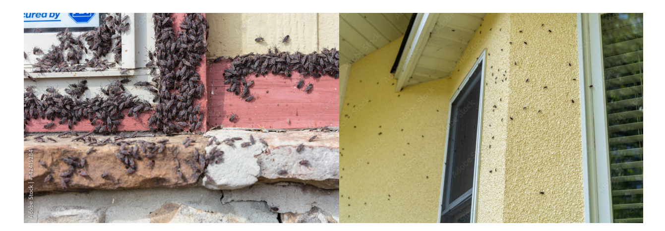
Figure 2: Aggregations of bugs, left - outside a home entrance, and right - on exterior walls.

young ones of most of these bugs are also patterned with different combinations of red and black. Aggregations can range from a few to thousands in number (Figure 2).