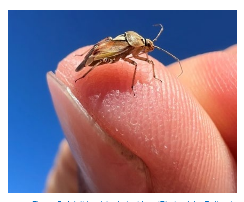
Figure 5: Adult tarnished plant bug.

Lygus bugs are bugs that belong to the genus Lygus, in the family Miridae. Some of them are important crop pests (e.g., tarnished plant bug Lygus lineolaris ). They are much smaller than seed bugs, differently colored and the adults measure about ¼ inch in length (Figure 5).