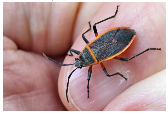
Figure 6: Adult Eastern bordered plant bug.

These bugs are named for the colorful contrasting edges to their wings, that give them a bordered look. They are common in low vegetation. A common species is Largus succinctus (Figure 6), which can be identified by the orange or red margin all around the elytra and across the base of the prothorax.