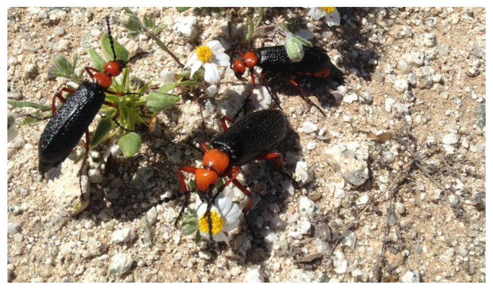
Figure 11: Adult desert blister beetles.

Blister beetles , Family Meloidae are named after their defensive secretion (cantharidin), that cause blisters on the skin of predators or intruders. The desert or master blister beetle , Lytta magister (Figure 11) is a common species.