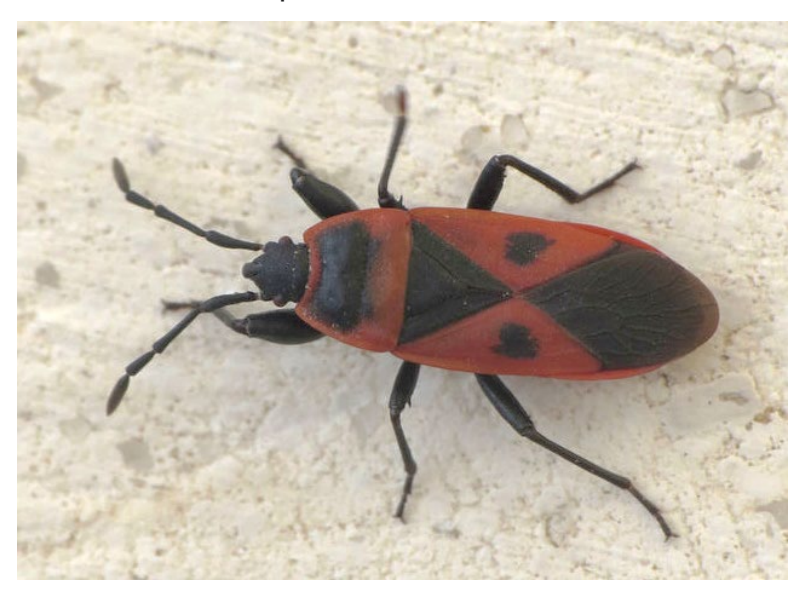
Figure 7: Adult Mediterranean red bug.

As their name suggests, many species of these striking bugs have bright red and black patterns. Some species stain cotton bolls due to their feeding and are considered pests. The Mediterranean red bug Scantius aegyptius (Figure 7), is an invasive species recently introduced to the U.S. The head, antennae and legs in the adults are black, and their red back has two round black spots.