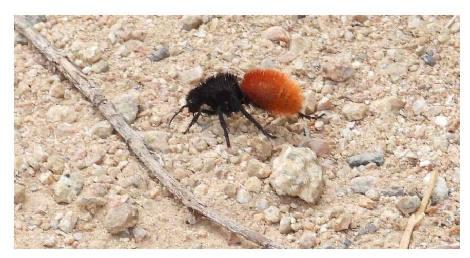
Figure 12: Adult female velvet ant (Photo: Cindy Howland-Hodson).

Velvet ants , Family Mutillidae are wasps that resemble large, hairy ants. The females are wingless and can be found running around on the ground. Some species are red and black in color (e.g., Dasymutilla magnifica , Figure 12), but other color combinations also exist. They look harmless, soft and furry, but can deliver extremely painful stings if handled.