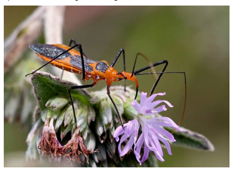
Figure 9: Milkweed assassin bug (Photo: Mary Keim).

Assassin bugs are mostly beneficial and many of them prey on other arthropods. The milkweed assassin bug Zelus longipes (Figure 9) is easily identified by its distinctive red and black patterns and long black legs.