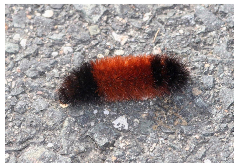
Figure 13. Woolly bear caterpillar.

Woolly bear caterpillars, also known as woolly worms or woolly bears, are actually the larvae of the Isabella tiger moth ( Pyrrharctia isabella ) (Figure 13). In the fall, these caterpillars start their annual crawls in search of sheltered quarters for winter. This is usually the time that you may see noticeable numbers of these caterpillars crossing roads. These caterpillars have alarm-orange bands on their back and short stiff hairs throughout the body. Some think that these sharp-pointed bristles may harm people or pets. In fact, these bristles/hairs serve as a defense against many types of predators and protect the caterpillars. They are not stinging hairs and don't inject venom. However, hypersensitive individuals may suffer severe reactions if the hairs penetrate their skin.