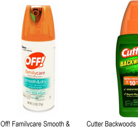
Cutter Backwoods Insect Repellent (Pump Spray): 25% DEET

Figure 2. Examples of insect repellents that contain different concentrations of DEET.