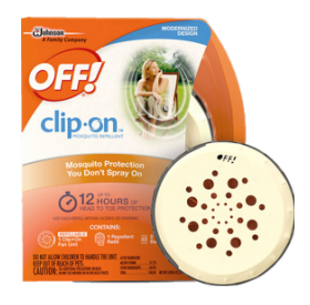
Off! Clip-on wearable device: 31.2 % metofluthrin

Ingredients vary, but research supports that metofluthrin and allethrin significantly reduce contact with mosquitoes through