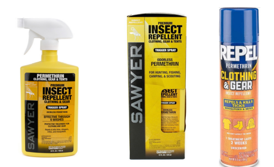
Sawyer Premium Insect Repellent Clothing & Gear, and Repel Permethrin Clothing & Gear Insect Repellent: Both 0.5% Permethrin

Permethrin-treated clothing is typically used by military personnel and others who are outdoors for extended periods of time in areas at high risk for mosquito or tick-borne disease transmission (Sukumaran et al 2014; Vaughn et al. 2014). As a clothing or gear treatment, permethrin is very effective at keeping ticks from attaching to you and at reducing mosquito bites. Spray applications of permethrin can remain effective for up to 14 days of exposure to light and air, or through two aggressive washings. By storing the treated clothing in black plastic bags between uses, the 14 days of protection can be extended considerably. If