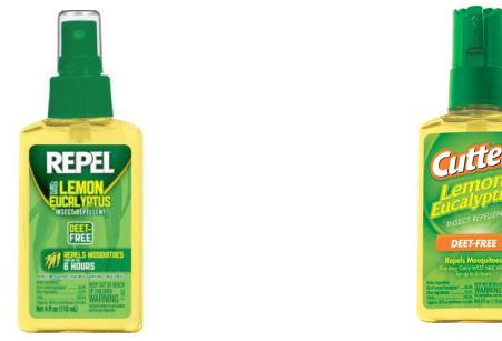
Repel Lemon Eucalyptus Pump: 26% oil of lemon eucalyptus

Oil of lemon eucalyptus is a natural oil extracted from the leaves and twigs of lemon-scented gum eucalyptus, Eucalyptus citriodora . PMD is a chemically synthesized version of oil of lemon eucalyptus, not an essential oil (see example products in Figure 4). PMD and the "pure" unrefined oil of lemon eucalyptus are chemically different. PMD may cause a reaction on sensitive skin and eye irritation if it enters the eye.