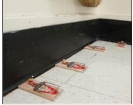
Traps can be baited with a variety of foods. There is no one "favorite" bait for

mice. Place traps against walls with the