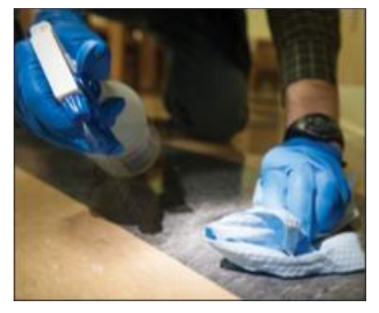
Wear rubber gloves and use a disinfectant when cleaning up mouse feces.