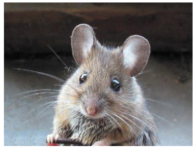
The adult house mouse.maine.gov

United States. They feed on and damage food, as well as contaminate food with droppings and urine. They cause structural damage to buildings by building nests and gnawing. They may chew on furniture, clothing and electrical wires. In addition, house mice can spread disease transferring pathogens or parasites to humans and pets, including Salmonella (salmonellosis food poisoning), ringworm, mites, tapeworm and ticks. They generate allergens, which are asthma triggers and should not be tolerated inside schools or homes. Effective, low hazard options are available to eliminate these pest rodents.