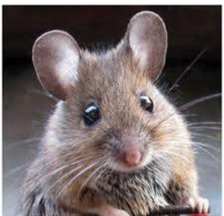
The adult house mouse. Bioweb.uwlax.edu

Burrows: Check in weedy places, under boards, under dog houses and near garbage cans or dumpsters. House mice may burrow outside structures when they cannot gain access or find other shelter.