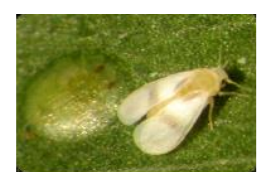
Fig 1. Ficus whitefly adult and mature nymph.

This exotic, invasive pest insect has recently been reported from the Phoenix area in Arizona , causing damage and defoliation in ficus trees. It first arrived in the U.S. in Florida in 2007. Ficus whiteflies are small, winged insects about ½, this inch in length, related to aphids, scale insects and mealy bugs. Nymphs (young ones) are ½, this to ½, this inch in length, flat and oval in shape with red eyes, wingless, and resemble scale insects (Fig. 1). Both adults and nymphs are typically found on the undersides of leaves, but occasionally on the upper sides also. They feed by inserting their needle-like mouthparts into the undersides of leaves and suck out nutrients, resulting in wilting, yellowing, stunting leaf drop and sometimes death of the plant. They are only reported to