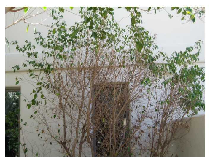
Fig 2. Severely defoliated ficus plant ( Ficus benjamina ).

The University of Arizona Cooperative Extension is working in partnership with