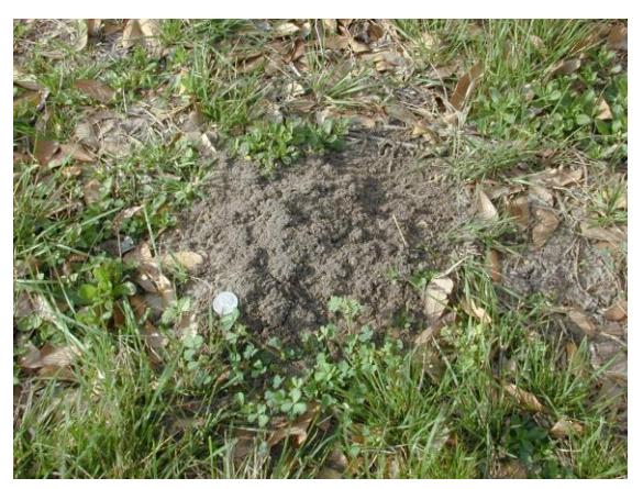
Native Southern Fire Ant Solenopsis xyloni colony mound