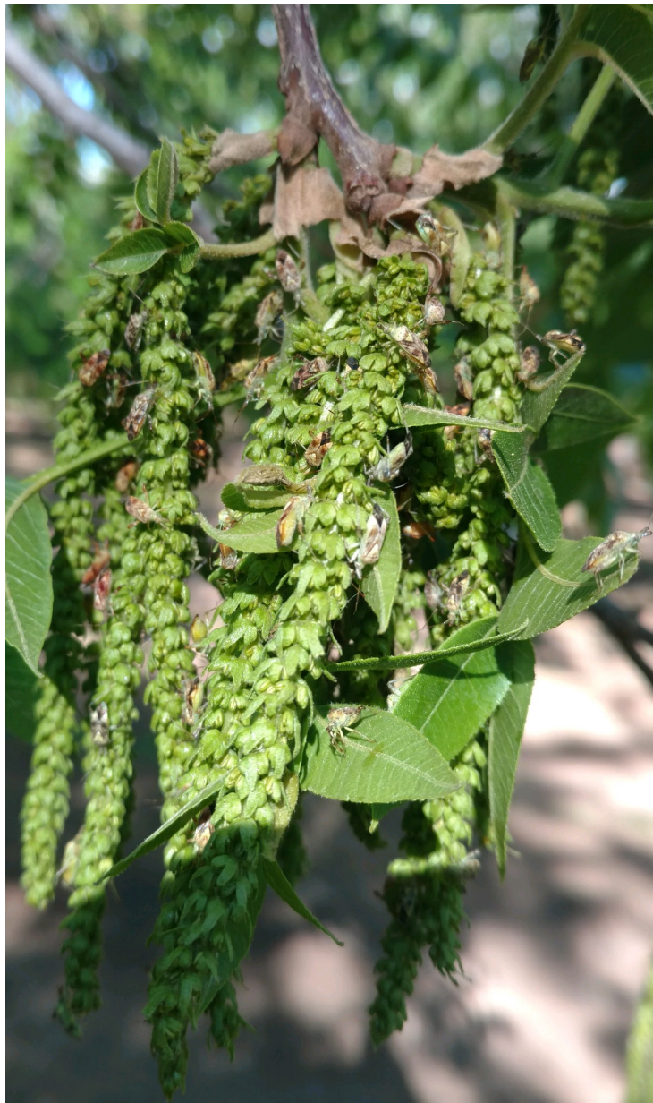
Pecan catkin infested with Neurocolpus spp. bugs in a central Arizona.

We are uncertain if the bugs being found on catkins will shortly become irrelevant to pecan growers, or if Arizona's experience will be closer to that of pistachios in California. For that reason, growers should